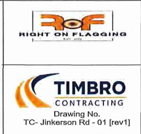
Figure # 7.8 in the TCMWR 2015 Edition Single Lane Alternating This Traffic Control Plan is designed to accommodate a hot tap connection and tie in crossing at Jinkerson Road and Skyline Drive for the Jinkerson Rd PRV Station Site #5 Project. Construction is expected to commence upon approval of the traffic plan Work hours shall be from 7:00 am - 5:00 pm Existing Conditions shall be restore outside of working hours

This traffic plan is based on a 30 Km speed zone