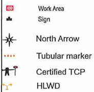
Figure # 7.8 in the TCMWR 2015 Edition Single Lane Alternating

This Traffic Control Plan is designed to accommodate a hot tap connection and and tie in crossing at Jinkerson Road and Skyline Drive for the Jinkerson Rd PRV Station Site #5 Project.